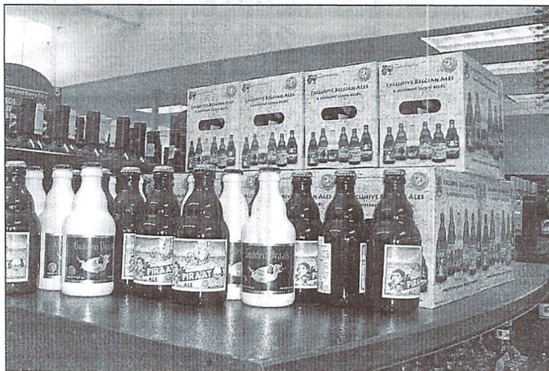
Beer lovers rejoice, Foodie's has a great selection.